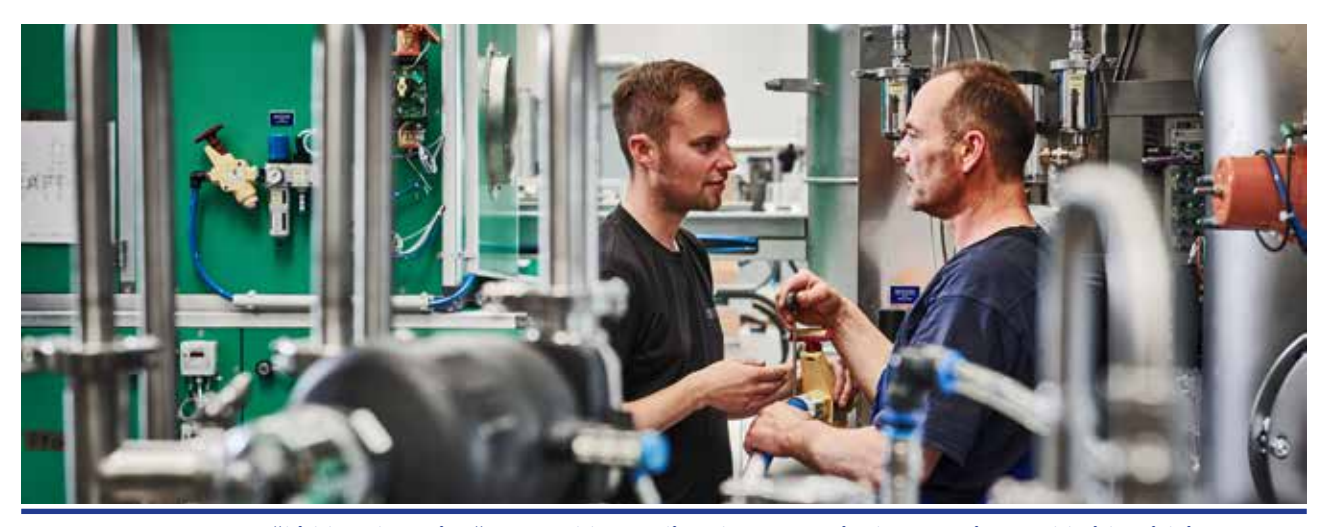
Strong team: As a true "hidden champion", L.B. Bohle supplies pharmaceutical companies worldwide with its machines and processes. Not always known to the general public, the company has developed into a market and technology leader over the course of time.

"Hidden champions" make a significant contribution to the economic strength of small and mediumsized enterprises and thus to Germany as a business location. They thus have a significant overall social responsibility. Secure jobs are created, including above all in non-metropolitan areas. The companies and their employees are also important taxpayers and promote consumption in the respective region. In addition, companies are often involved in social and charitable activities. They are known to support local sports and cultural clubs as well as promote other initiatives.